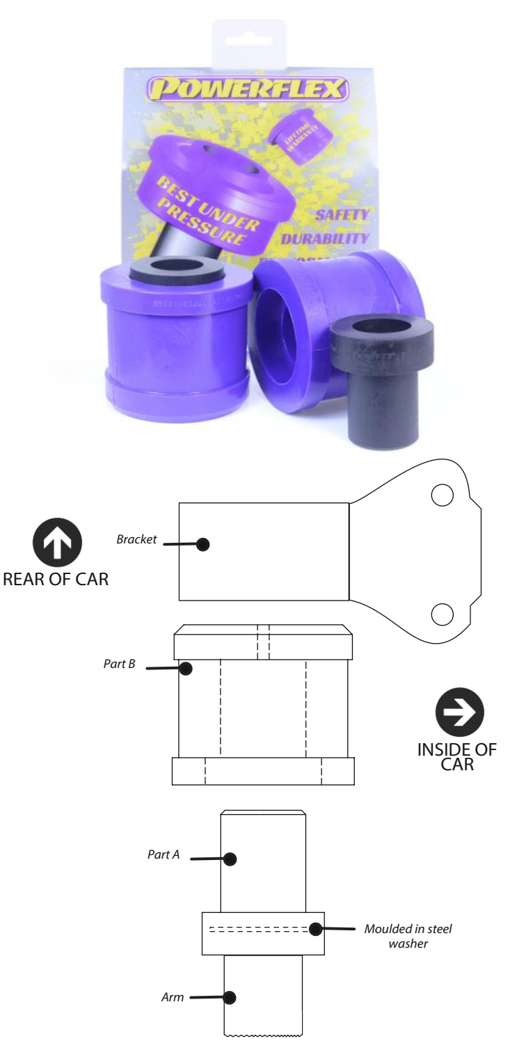
Figure 1 - diagram showing how part A and part B fits inside the bracket and into each other